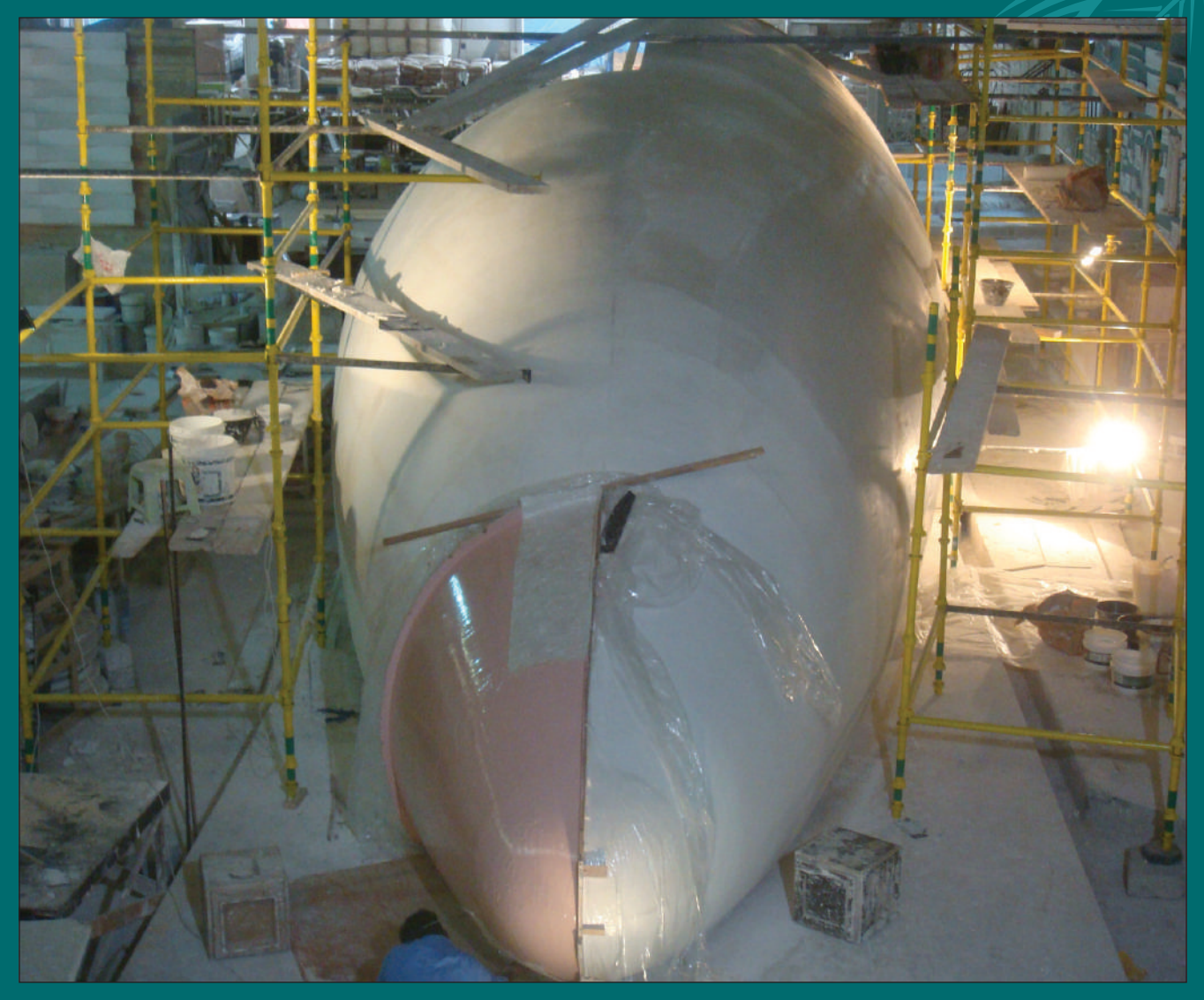
- Full Size Gypsum Template For Casting GRP