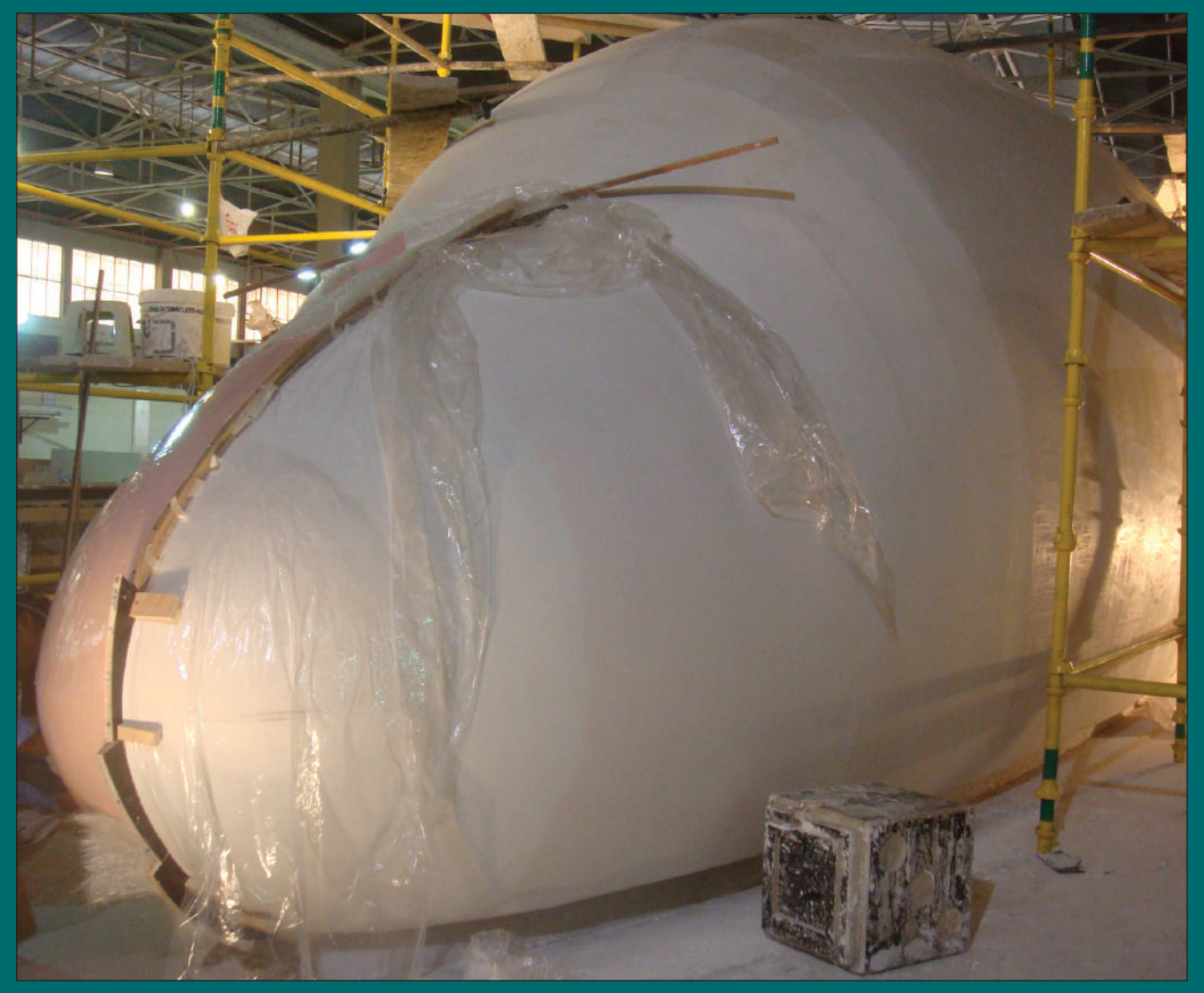
- Full Size Gypsum Template For Casting GRP