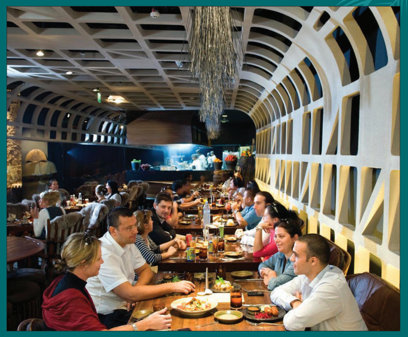
- GRP Feature Covering The Whole Dining Area